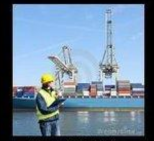
What I think I do.