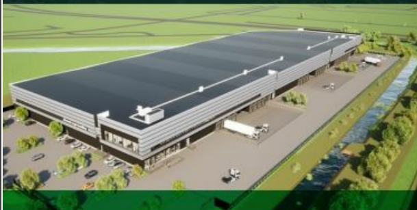
New building Allround Cargo Handling Opening June 2021

Allround Cargo Handling | part of K-Square