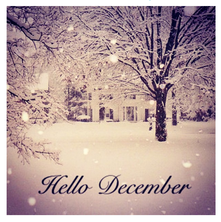
Click the photo to see the holiday list!