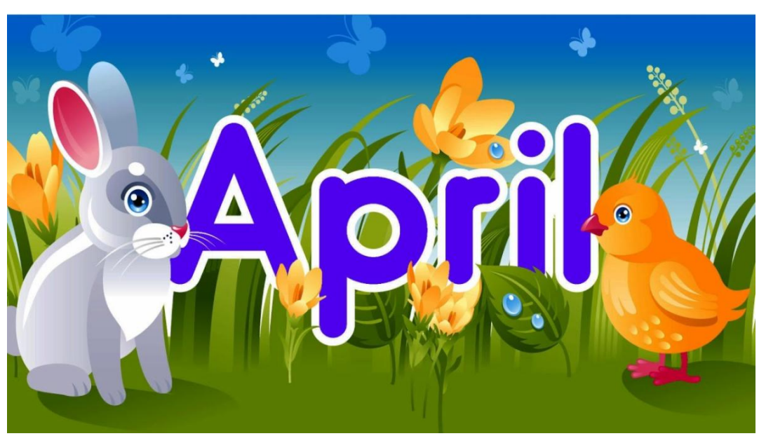
To see the April holiday list, please click the photo!