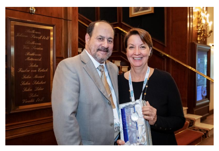
Panamerican Logistics SOUTH AMERICAN REGIONAL PARTNER OF THE YEAR AWARD

NORTH AMERICAN REGIONAL PARTNER OF THE YEAR AWARD