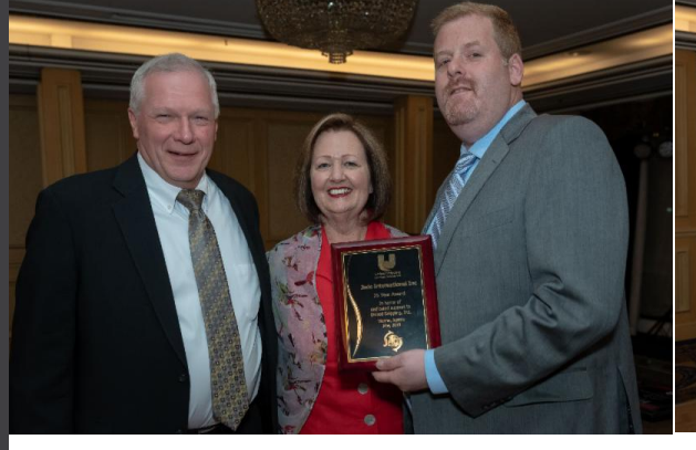
Jade International Inc 25 Year Award