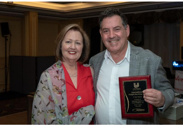
International Freight Services 5 Year Award