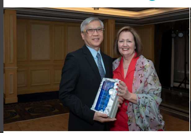
Fordpointer Shipping ASIA REGIONAL PARTNER OF THE YEAR AWARD