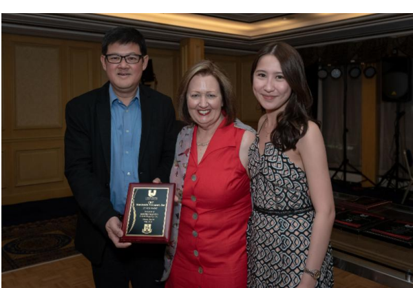
CNT Worldwide Transport 15 Year Award