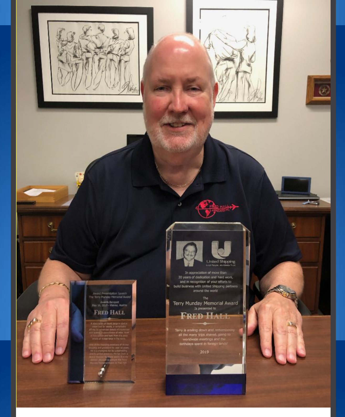
To All Award Winners

Congratulations to each and every award winner this year. Your hard work & diligence inspires us all. We encourage you to share your achievements in your own newsletters. It reflects your hard work and every award is something to be proud of - Congrats to all!