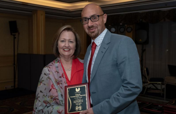
General Transportation Services 15 Year Award