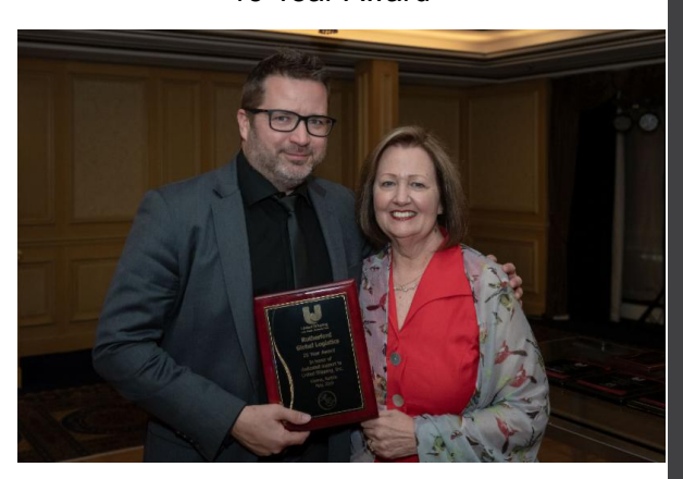
Rutherford Global Logistics 25 Year Award