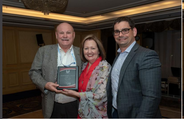
Midwest Transatlantic Lines OPERATIONS