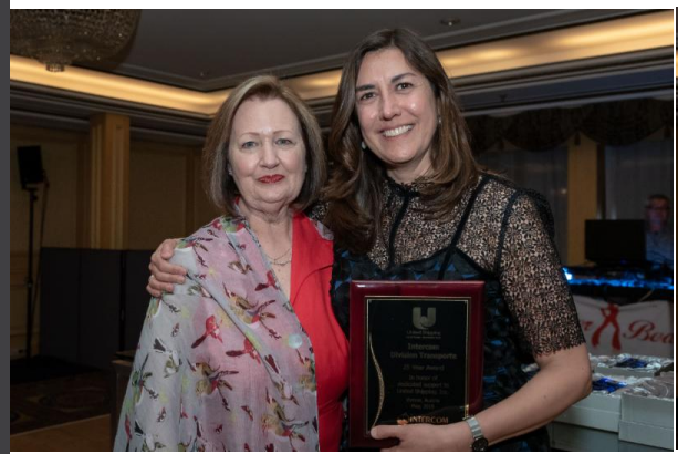
Intercom Division Transporte 25 Year Award