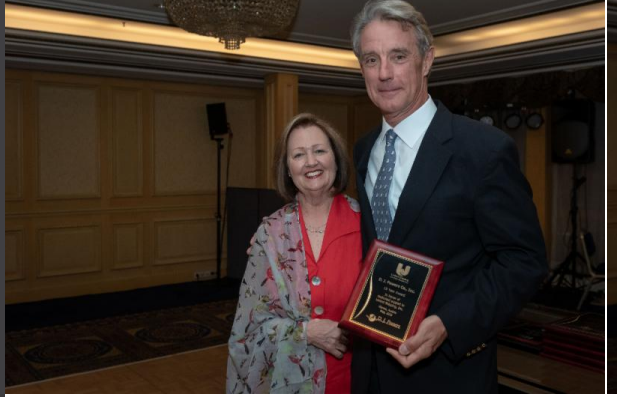
D.J. Powers Co 15 Year Award