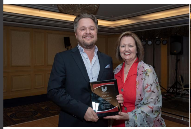
NTEX AB COMMUNICATIONS