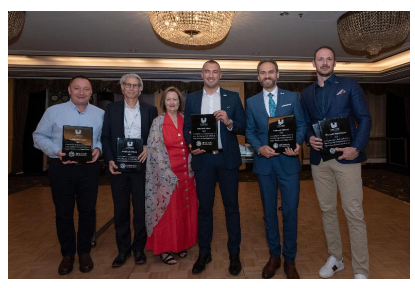
Delamode Group Moldova, Latvia, Bulgaria, Balkans, Macedonia and Montenegro