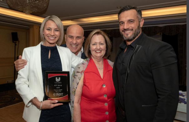
RDT Group SALES