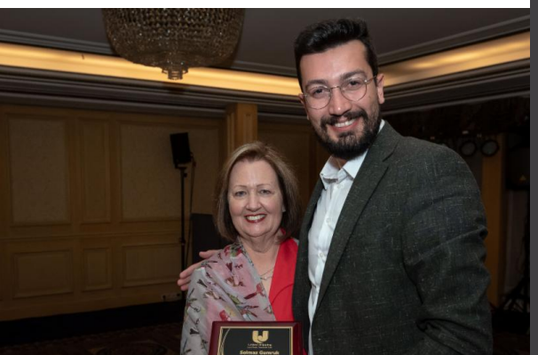
Solmaz Gumruck Musavirligi 25 Year Award