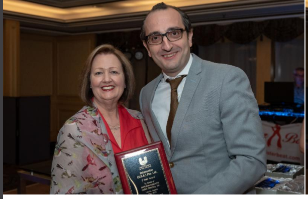
Interunion S.E.A. 5 Year Award