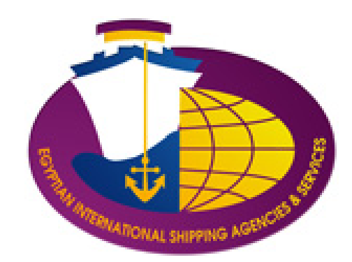
Egyptian Int'l Shipping Agencies 15 Year Award