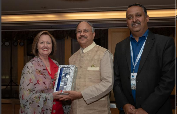
ATC Global Logistics